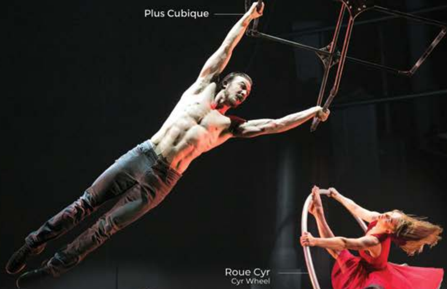
Roue Cyr Cyr Wheel