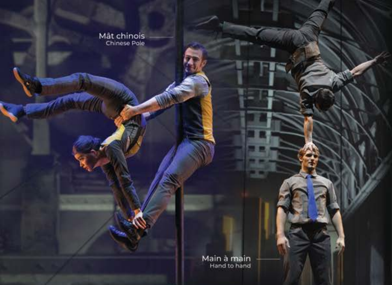
Main à main Hand to hand