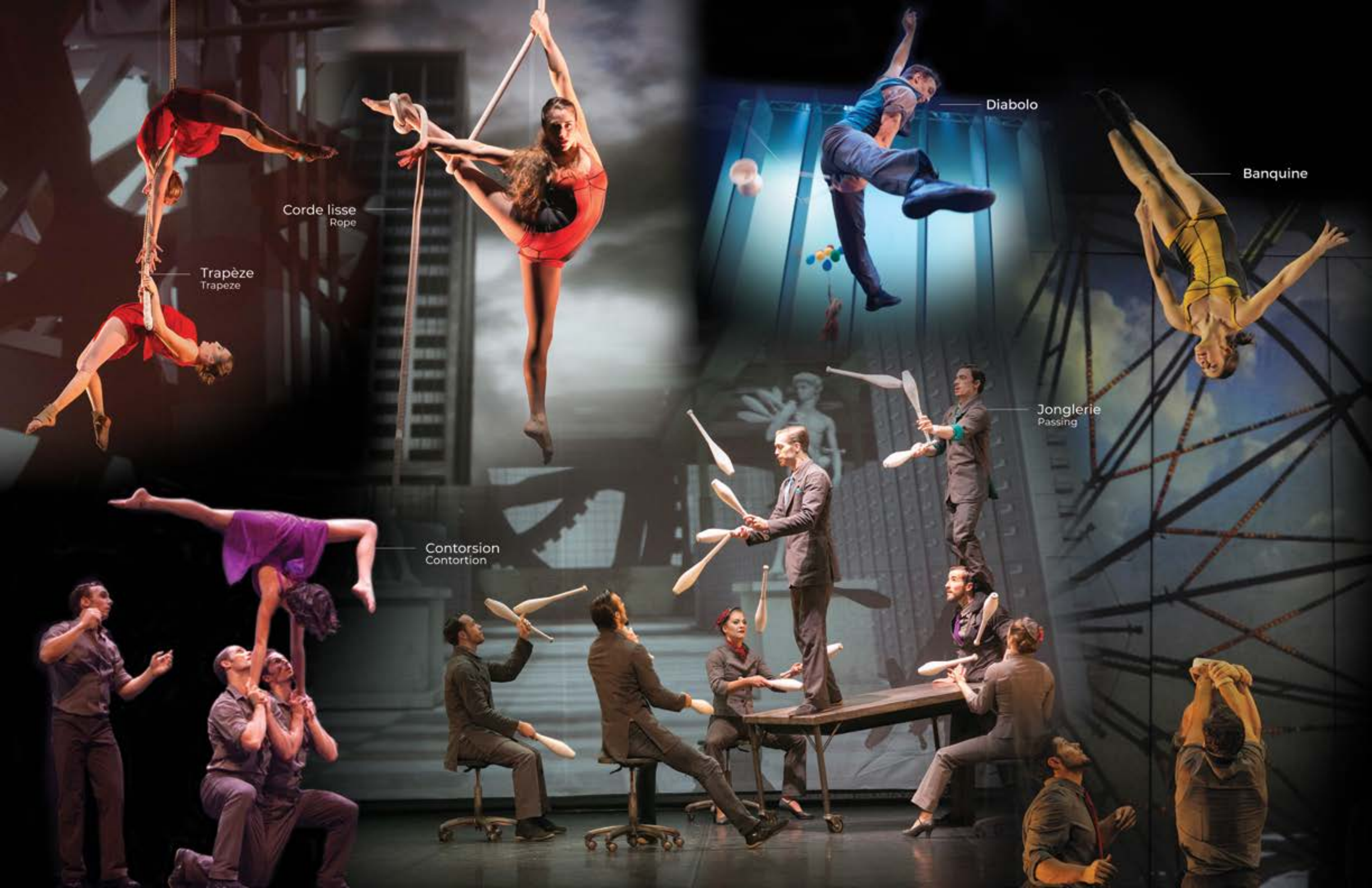
Corde lisse Rope